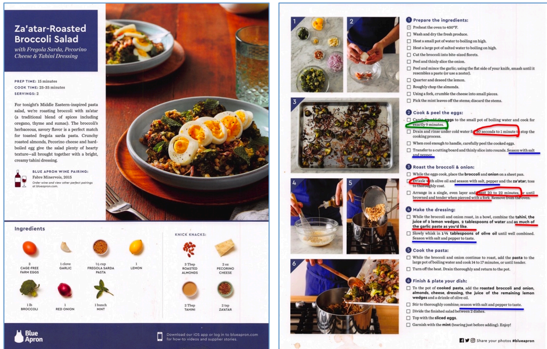
Figure 1. Blue Apron Recipe (front and back) with annotations where instructions were to add salt (underlined in blue), seemed imprecise (underlined or circled red), or overly precise (circled in green).

With my story, I was trying to illustrate the appropriateness of thinking for yourself, without needing to deeply understand the Umwelt of the situation (cooking a particular dish). Simply trusting and directly following “recipes” or “patterns” because they are published or credentialed might well lead to inedible dishes or to poorly designed software.